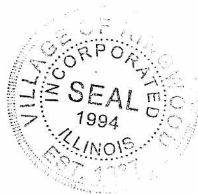
Veronica Gaddis Village Clerk