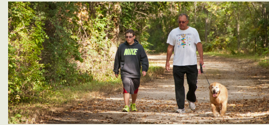
Sites open sunrise to sunset. Check for trail closures and alerts at MCCD.me/Status